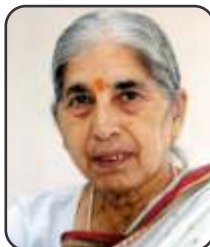
Ms. Laxmi Kanta Chawla Former Cabinet Minister