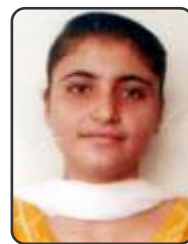
Prinka 2nd in GNDU PGDFD