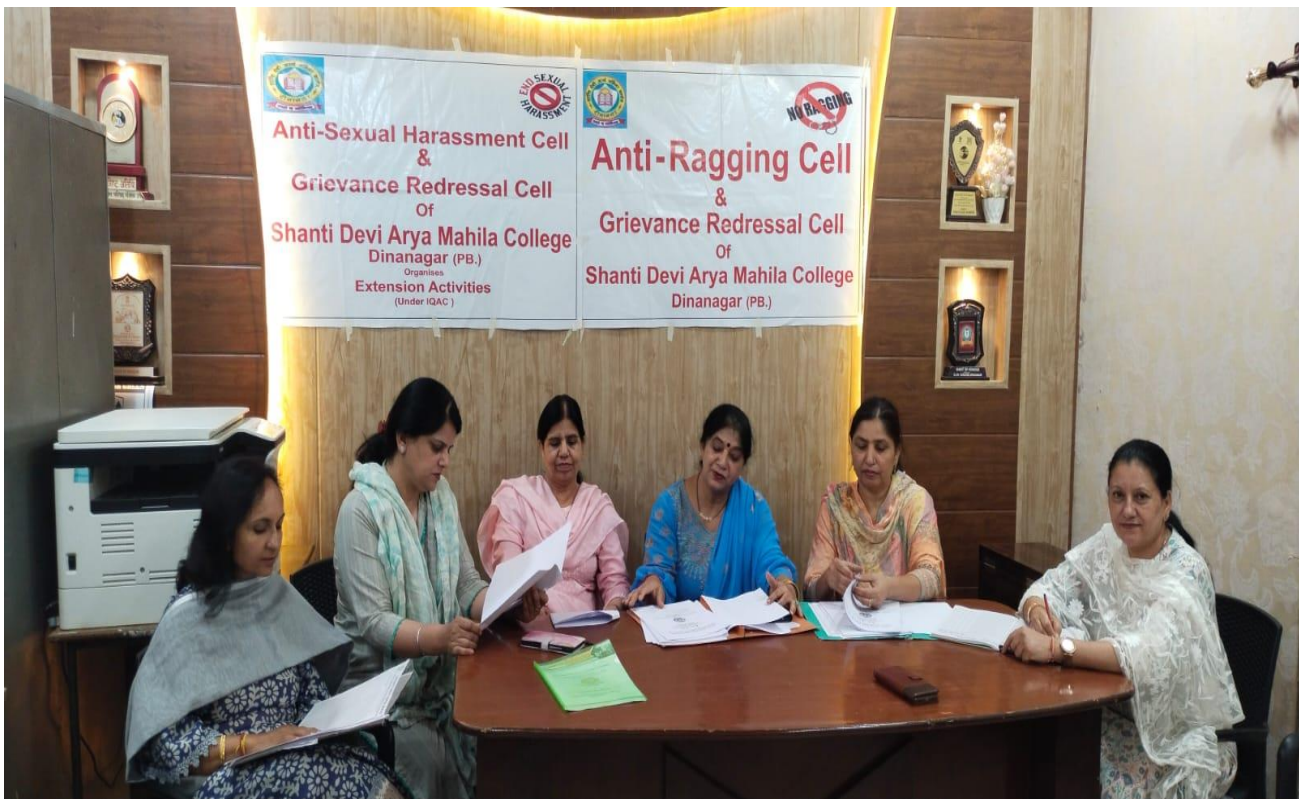
Meeting of Grievance Redressal Cell members