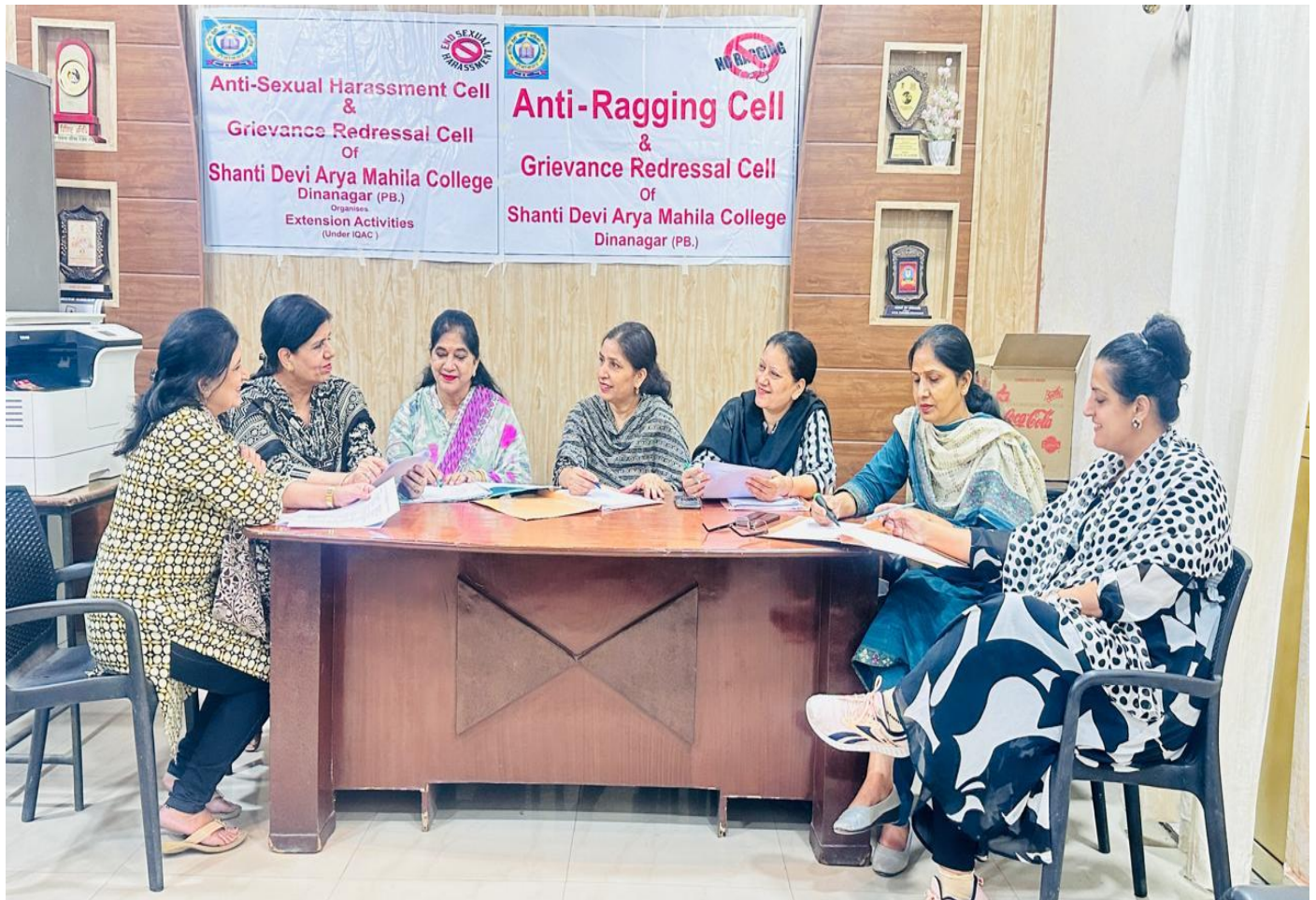
Meeting of Grievance Redressal Cell members